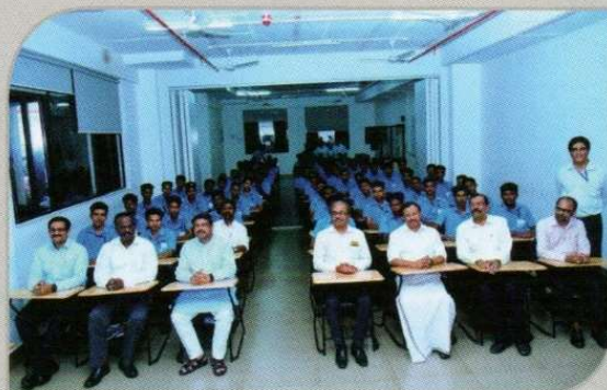
Hon'ble Minister with students