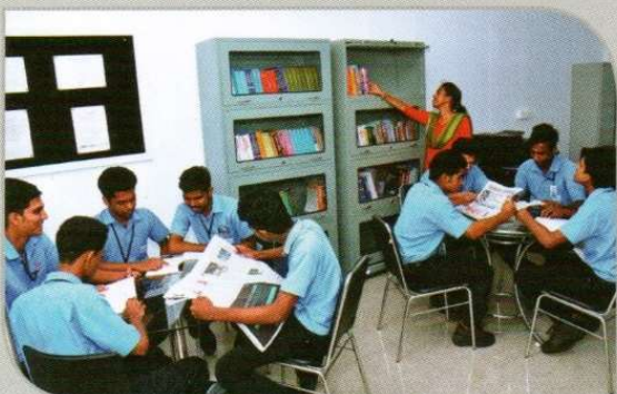
Library & Reading Room