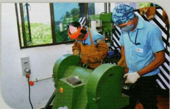
Fitting/ welding workshop