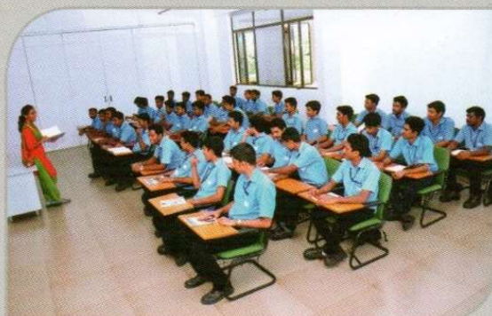
Class in progress